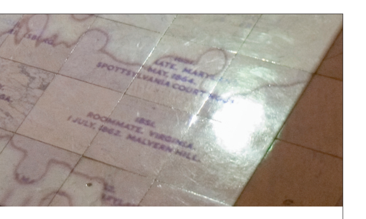
Deep Wounds, 2006 Installation view (detail), Memorial Hall, Harvard University, Cambridge, MA